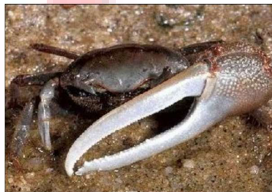
Fiddler Crab: look for them racing into their holes in the banks