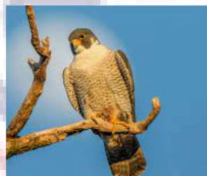
Endangered Peregrine Falcon