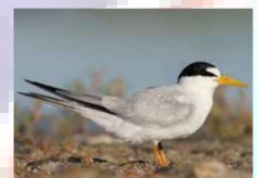
Endangered California Least Tern