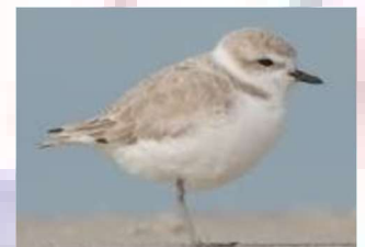
Endangered Snowy Plover