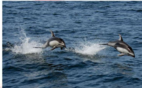
Pacific White-Sided and Common Dolphins