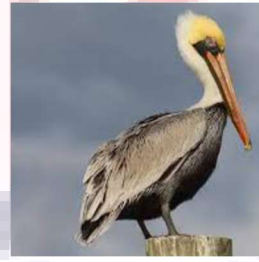
Endangered Brown Pelican