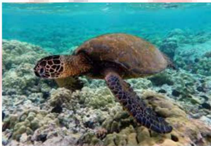
Endangered Green Sea Turtle