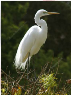
Egrets, Snowy and Great

Over 215 species of birds can be found here